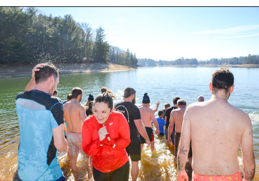
Dozens of people participated in the Polar Bear Plunge by Vertical Church at Lake Nottely Photo by Shelly Knight on Jan. 25.

By Shelly Knight Towns County Herald Staff Writer