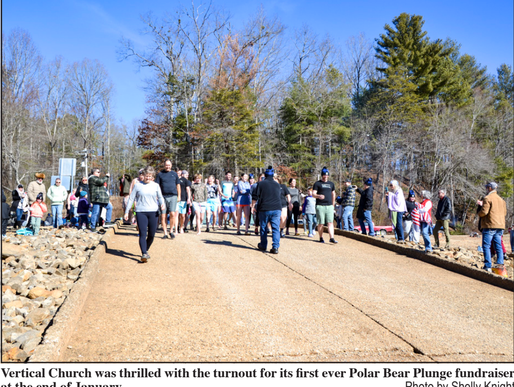
at the end of January. is, I'm a little numb right now, nah Graham. "It's the craziest kind of needed it."