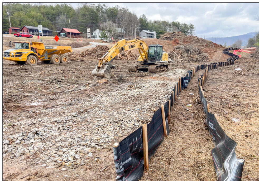
Phase II of the project continues between Earl Shelton Road in Union County and Sampson Road in Towns County.